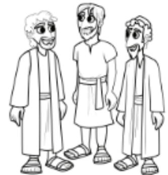
Thaddeus, Simon and Judas