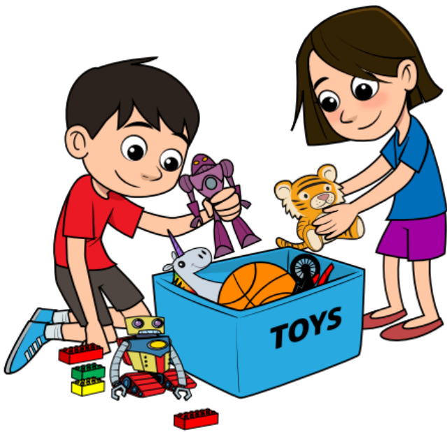
Children Cleaning Up Toys