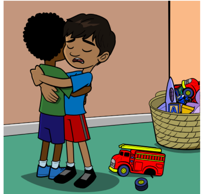
Friend Hugging and Saying "I'm sorry I broke your truck"