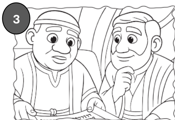
The man in the chariot was reading God's words but needed help understanding them.