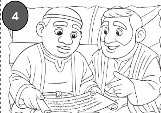
Philip sat with the man and they read God's words together. Philip helped the man understand.

Philip • Acts 8:26-35 • I can hear from God.