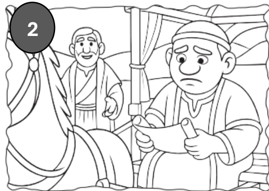
The angel told Philip to walk down the road and God told him to go to the chariot.