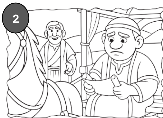
The angel told Philip to walk down the road and God told him to go to the chariot.