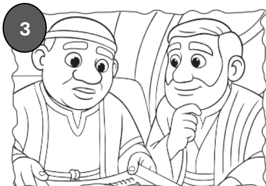
The man in the chariot was reading God's words but needed help understanding them.